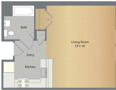
Typical Studio - Dimensions are approximate