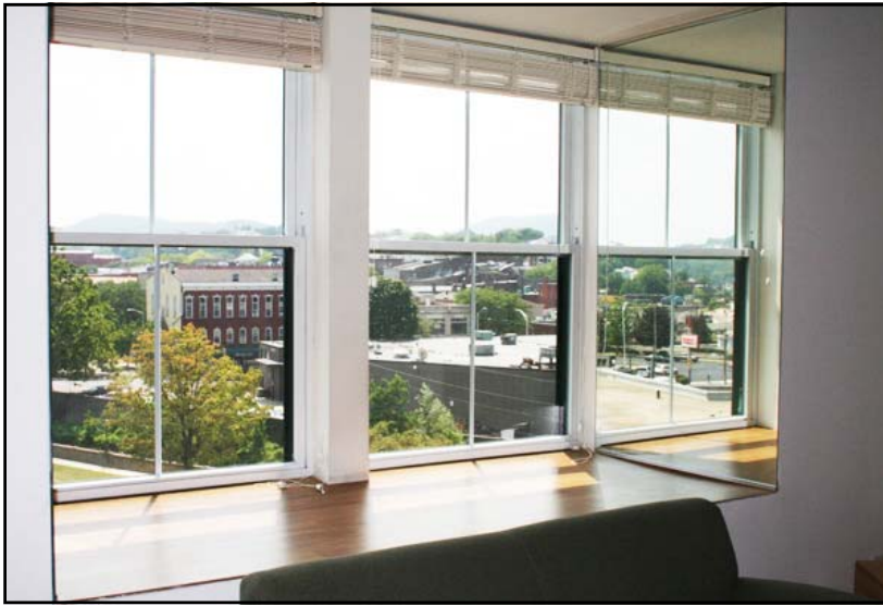
Top Floor Apartments with Great Views